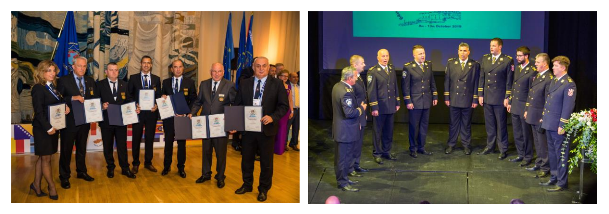
The wonderful Organising Committee

responsibility only last year, this is an even more remarkable achievement. The constraints and the workload are enormous. So first and foremost, I would like to present our grateful thanks to the President of IPA Croatia, to the members of the organising committee and to all the volunteers who helped out before and during the whole week, answering the same questions over and over again with care and attention for everyone. We did not only discover the beautiful sights of Croatia, but also the kindness and smiles of its people. The location of the hotel in the beautiful little city of Cavtat was superb, on top of the cliffs, with a dreamy view over the Adriatic Sea and several islands.