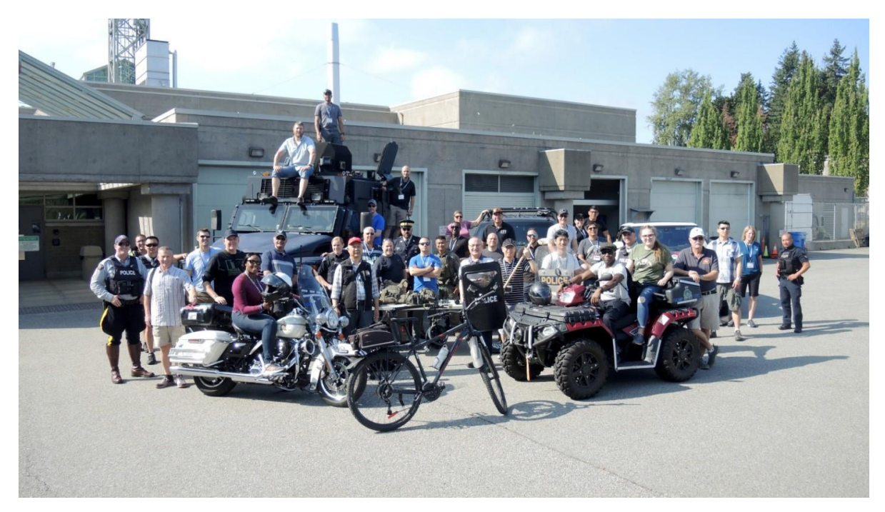
Surrey Detachment Group photo with police vehicles

The tour continued through Vancouver with an explanation and views of some of the policing challenges in downtown Vancouver. The group was then taken for a tour of Stanley Park and the Vancouver Police Mounted Squad. The main attraction was spending a few hours at Capilano Canyon for picturesque views of the mountains, streams and rain forest. These views were enjoyed from a 137-metre-long suspension bridge, walkway along cliffs and tree top suspension bridges.