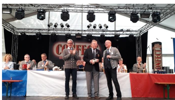
On stage with the Bürgermeister of Grünberg