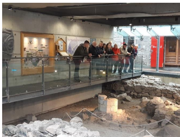
Some of our group hear details of an archaeological find in Galway city centre