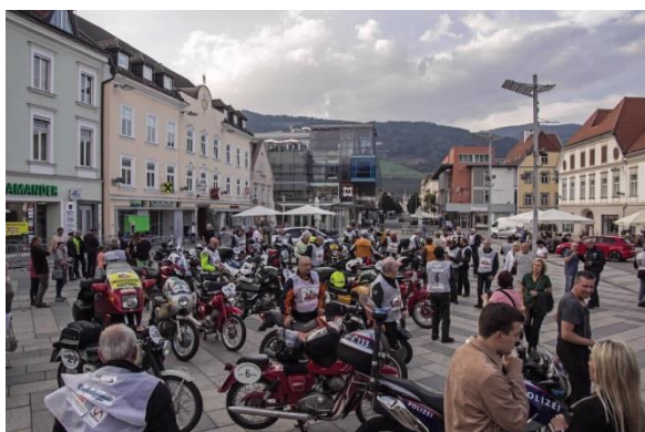
Biker am Hauptplatz von Leoben

Am 6. September traf der Tross beim Brücklwirt in Niklasdorf ein. Dort gab es in der wunderschön und festlich gestalteten Parkanlage nach der Begrüßung durch die