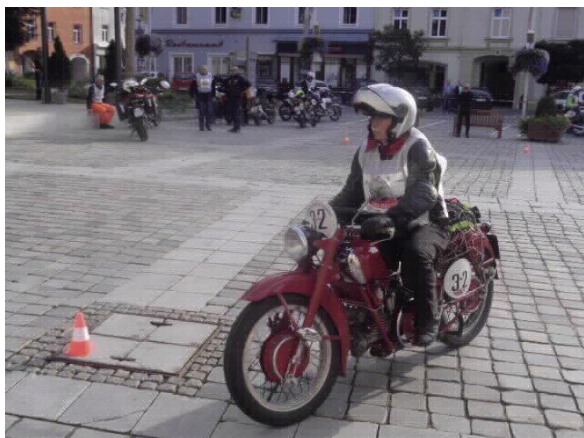
Hindernisparcours Hauptplatz Judenburg

In Zeltweg wurde die Gruppe vom Vorstand der IPA Leoben in die Obhut des Vorstandes der IPA Murau-Murtal übergeben. Der Abend klang in angenehmer Atmosphäre bei Plaudereien und der Besprechung des Programms für den Folgetag im Beisein beider Verbindungsstellenleiter aus.